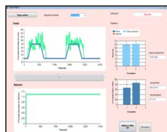
Result analysis window