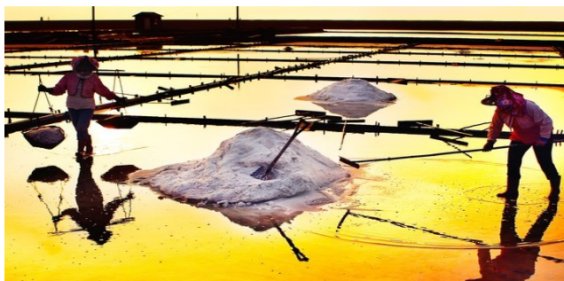
Fig. 1. Salt production in salt marshes

Natural sea salt production in salt marshes is a process where sea water circulates from basin to basin. Due to the influence of sun action and wind, water evaporates and salt concentrates into to the crystallization basin from which it is recovered (Figure 1)